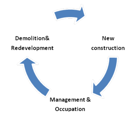
Fig. 2 Lifecycle diagram of activity areas covered within CRESS. Source [30]

The lifecycle diagram (Fig. 2) describes the activity areas covered within the CRESS.