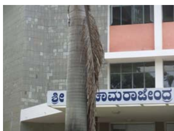
(a) First image