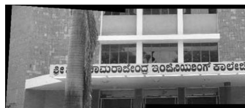
Fig. 6. Mosaiced entrance image