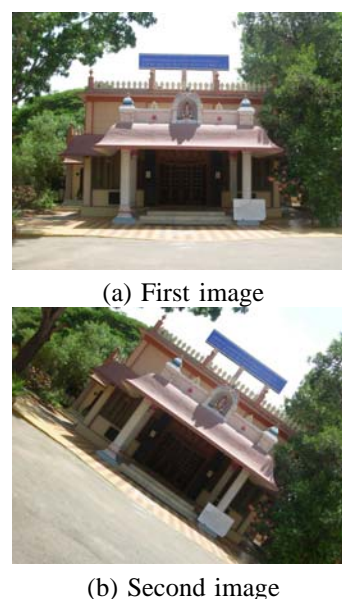
Fig. 2. Temple image

2) Experiment on Temple image: The input images are fig.2 (a) and fig. 2 (b), the mosaiced image is fig. 5. The black region indicates the region where no mapping is done. This is considerably a large area due to the fact that the input images respect the same visual scene. Comparing 5 and 2 (c) in the mosaiced image. In the implementation of the first algorithm we have taken the first image as the base image, therefore we find that the Mosaiced image is also based on the first image. Hence the temple is not tilted in the Mosaiced image. But here the image is tilted as the second image is