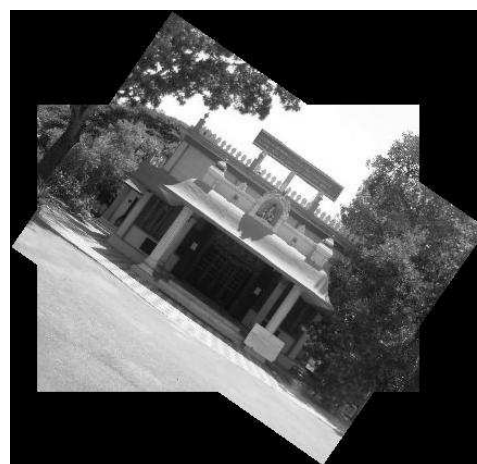
Fig. 5. Mosaiced temple image