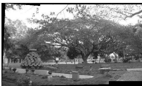
Fig. 4. Mosaiced fountain image